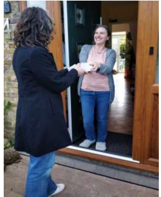
Collecting a Camera

In addition we encourage borrowers to survey other people's homes and buildings within their community, as well as their own, massively increasing the impact of the scheme. We've had an amazing uptake of this with 19 borrowers surveying 133 buildings, including whole streets, rental properties and Shepreth Village Hall, where an unused chimney was shown to be losing heat.