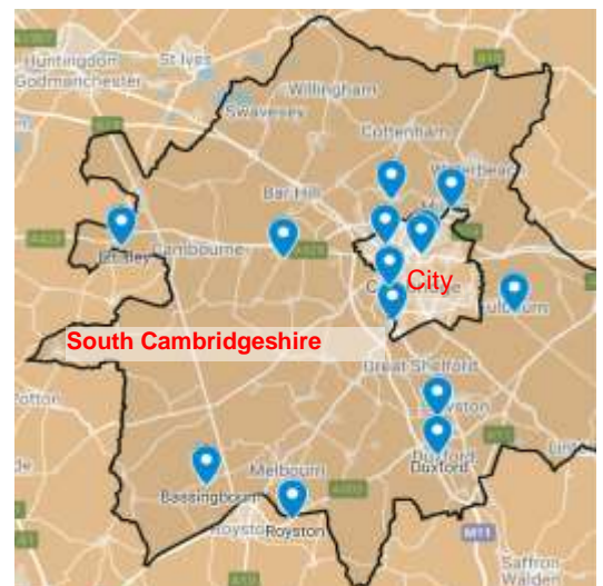
Camera Host Locations