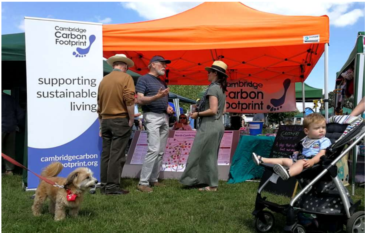
CCF takes sustainable living to the public at Chesterton Festival