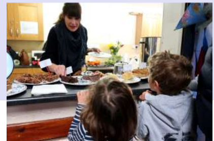
Important work keeping visitors and volunteers fed

Thank you to our invaluable and dedicated 345 volunteers who donated an astounding 6,294 hours of their time, knowledge and skills to making 2019 another effective year. Ranging in age from 18 to their mid-eighties, the skills and knowledge contributed by this group to bringing about a more sustainable city and region is awe-inspiring.