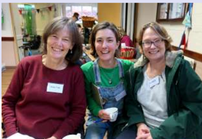
Barrington Repair Café organisers and volunteers

The experience our volunteers bring as designers, workshop hosts, bakers, engineers, IT experts, data crunchers, administrators, Trustees, accountants, fundraisers, public speakers, mic runners and event volunteers is inspiring.