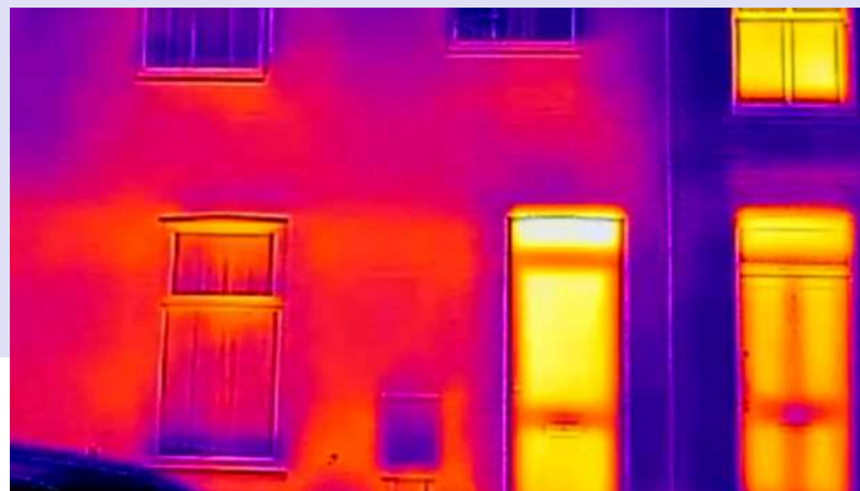
A thermal image revealing doors and windows leaking heat