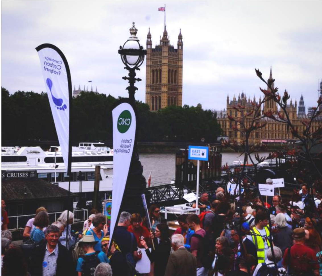
CCF and Carbon Neutral Cambridge amongst the throngs of people at the Time is Now mass lobby

CCF also made submissions to these 2019 consultations: