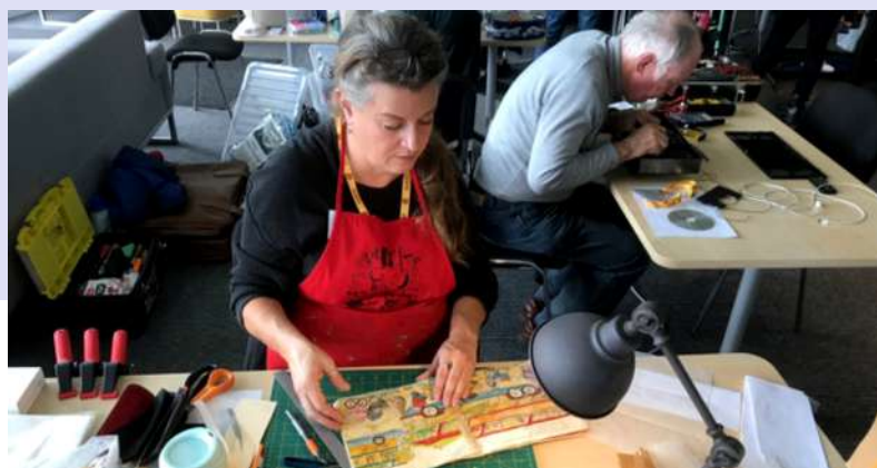
Cambridge University Press and Cambridge Assessment's first Repair Café