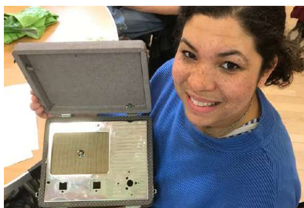
A Pye radio is successfully repaired