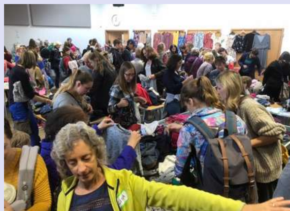
The very busy Histon swish

The brand new Community Clothes Swap Kit that we were able to purchase with money from SCDC's Community Chest has proved very popular and was an essential piece of kit at Histon's first Swish which attracted 175 people and thousands of items of women's, men's and children's clothes. Histon and Impington Sustainability Group who ran the swish partnered with children from the local eco-council who ran a dressing up exchange.