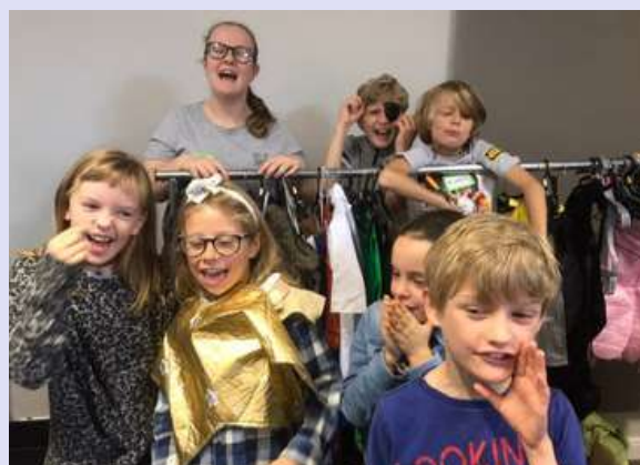
Histon Kids enjoy the dressing up exchange