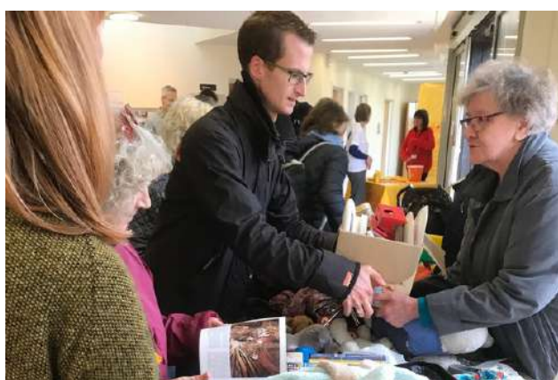
An exchange in progress at the give and take stall