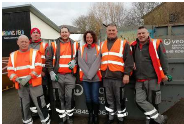
The Veolia team helping out at the Fix-Fest