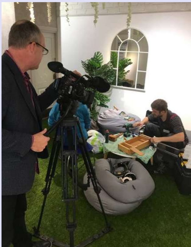
ITV help spread the word filming at the Cambridge Remakery

Media coverage continued to be strong this year with 12 features and articles in the Cambridge Independent and further coverage in the Cambridge News, Velvet Magazine, BBC Radio Cambridgeshire and other regional platforms. Nationally there were two interviews with BBC Radio 5 Live, coverage of Open Eco Homes and the Cambridge Remakery on ITV and Look East and our partners at Soham Repair Café were filmed for BBC1's primetime 'Shop Well for Less' programme. Cambridge 105 broadcast these interviews from the Cambridge Remakery.