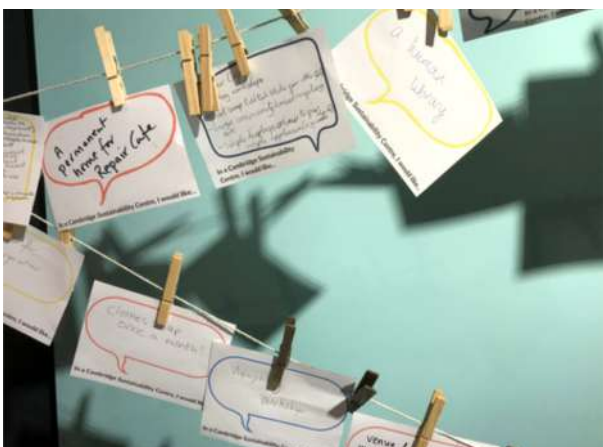
Ideas shared at the Remakery for a permanent sustainability hub in Cambridge

In 2019 we doubled our efforts to find out what people want for the region. At The Remakery in The Grafton, 67 people shared their wishes for what to include in a permanent city based Sustainability Centre and we produced the Sustainable North Cambridge Map to inspire conversations about sustainable living in this part of the city.