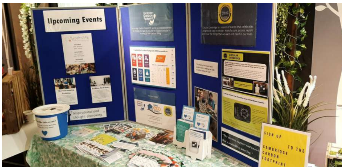
The CCF Stall gets an outing at the Cambridge Remakery