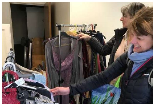
Browsing the clothes swap