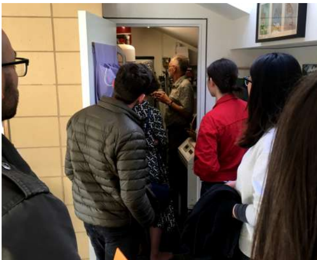
Taking a peak at the utility room on the Madingley Road tour

Very informative –great stepping stone for ideas and understanding for your own project.