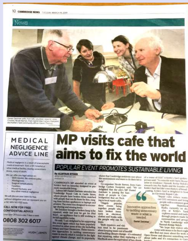
The Cambridge News covers the Swap, Collect & Fix-Fest