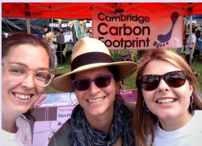
CCF staff and volunteers break for a quick selfie on the Chesterton Festival stall

Stalls are an opportunity for us to talk one on one with people who might not ordinarily attend a CCF event. In 2019 we ran 5 stalls, including two at North Cambridge community events where we shared our new Sustainable North Cambridge Map . We also ran stalls at the Cambridge Literary Festival, Cottenham Eco Festival and the Ladybirds WI's International Women's Day celebrations.