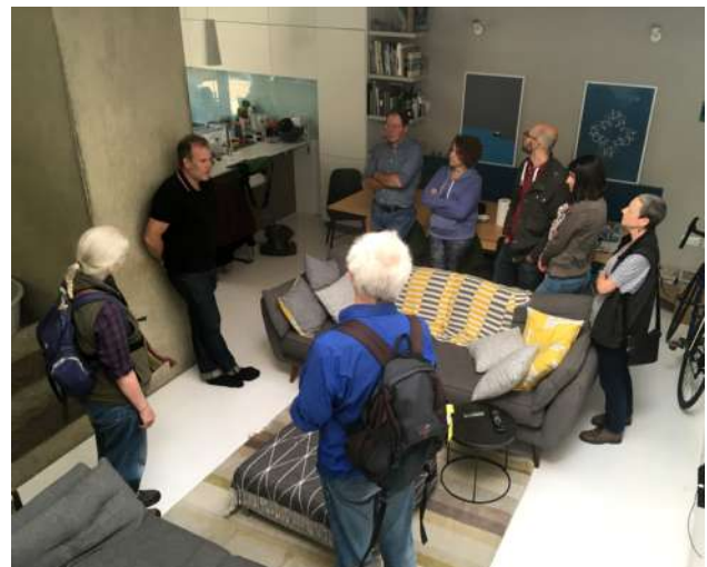
Exploring insulation, natural light and air-tightness on the Auckland Road tour

Clever use of space and light to construct a sustainable building.