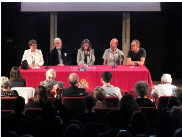
Our expert Cambridge 2030 panel

We celebrated a decade of Open Eco Homes with Cambridge 2030. We reviewed the highlights of these 10 years and brought together some of the brightest minds working in low-energy housing today to help us chart a course to zero carbon housing. Baroness Brown of Cambridge, Julia King, Deputy chair of the Committee on Climate Change , introduced what's needed over the next decade for a tolerable climate. Other expert speakers shared innovative and inspirational methods of tackling the big challenges we face. Open Eco Homes expects to play a useful part, inspiring and informing low carbon solutions.