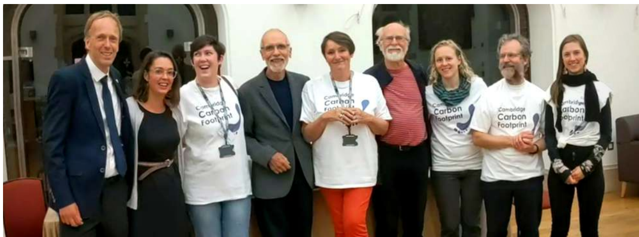
CCF staff and volunteers celebrate the very successful Cambridge 2030 event