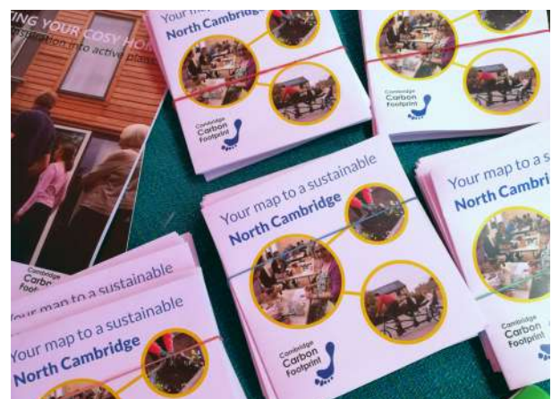
The Map for a Sustainable North Cambridge laid out ready for a stall