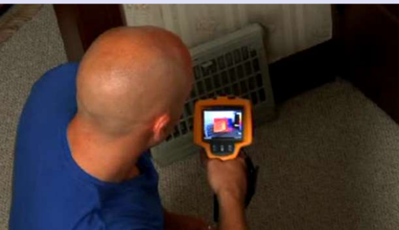
Thermal imaging camera in use

In 2019 we trained 39 more local people on how to use our two thermal imaging cameras to identify the draughts and insulation gaps causing their homes to leak heat. Thirty-five home surveys vividly revealed to householders where their homes were losing heat over the winter months and helped put them on track to finding solutions.