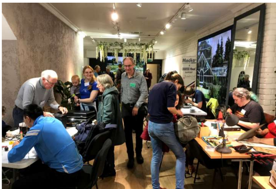
Repair Cafe in progress at the Cambridge Remakery

60+ ideas shared for a local sustainability hub