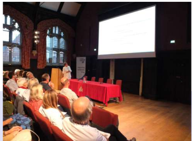
Baroness Brown of Cambridge gives the keynote address